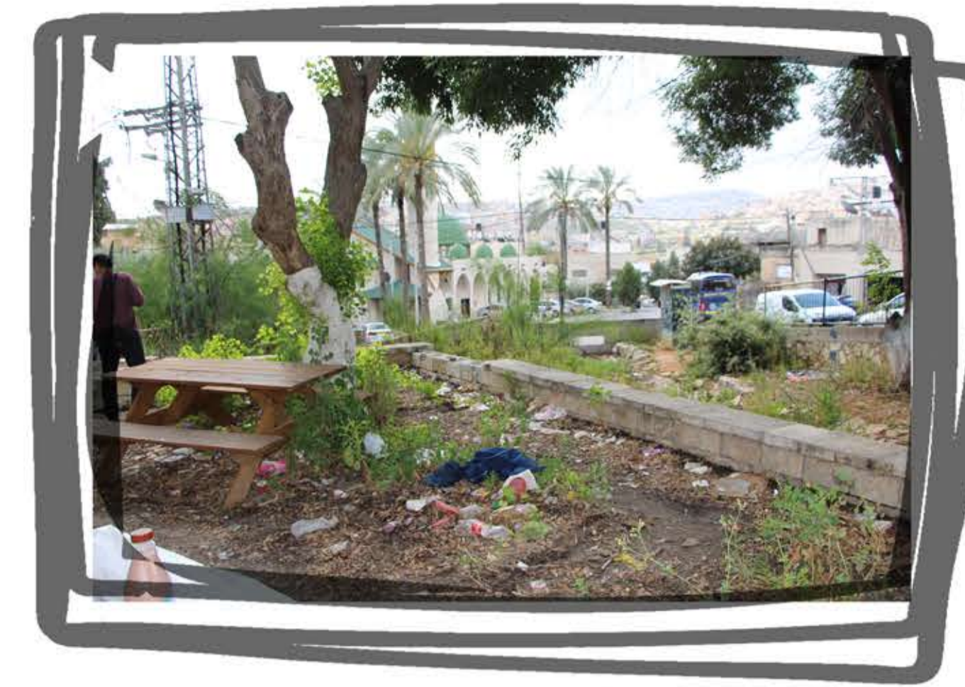
Current situation- Ein Ibrahim garden

to take place-making to connect to small childrens