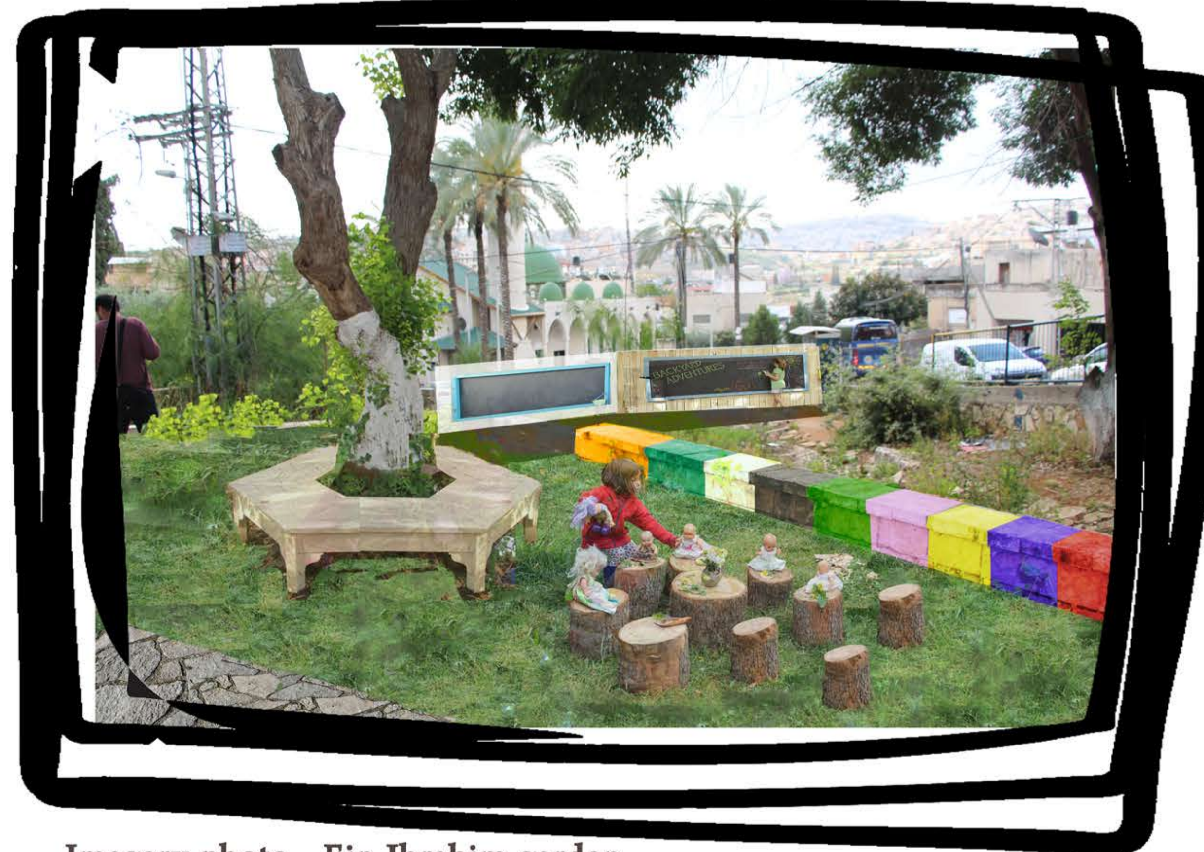
Imagery photo - Ein Ibrahim garden